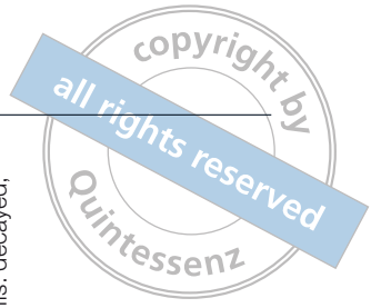
Table 4 The oral health status between baseline and the second evaluation.