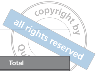
Table 1 Comparison of the baseline characteristics of the test group and the control group.