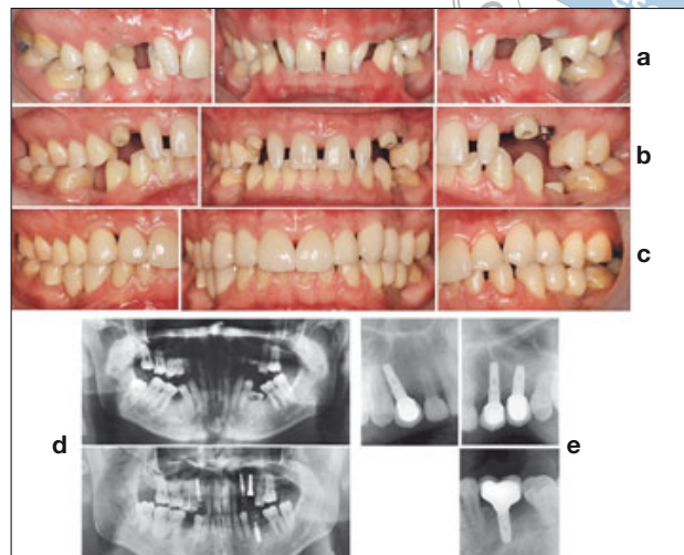
Fig 3 The oral views (nine upper panels) of the original status (a) after orthodontic treatment and after implant surgery (with temporary abutments) (b), and the completed prosthodontic treatment of ceramic veneers for 11 and 21, the ceramic crowns for 12 and 22, the porcelain fused metal bridge for 45 (44 and 46 as retainers), and the implant-supported crowns of 13, 23, 24, 35 (c). (d) The panoramic radiographs of the original status (upper) and after orthodontic treatment and implant surgery (lower). (e) The periapical radiographs of implant-supported crowns for 13, 23, 24 and 35, respectively, which were recorded 9 months after the prosthodontic treatment was completed.

Generally, in comparison to non-syndromic patients, oligodontia results in a more severe affect on the number of missing teeth, malocclusion, unsatisfactory jaw relationship and affected primary teeth in syndromic patients, according to reported literature 2 and our clinical experiences in the treatment of this type of patient. Amongst the limited literature concerning congenitally missing primary teeth 16,17 , the prevalence is under 1% in the epidemiology study, which is much less than hypodontia in permanent dentition. With regard to the results of our study, all subjects with hypodontia of the primary dentition presented with hypodontia of the permanent dentition, which is similar to that reported in the literature 16-18 , while most of the permanent teeth hypodontia patients have normal primary dentition. The