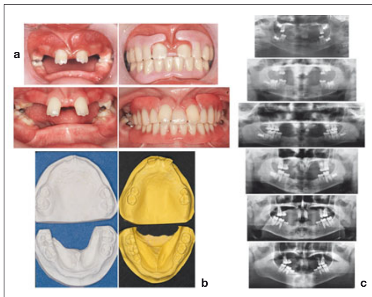
Fig 2 The non-syndromic oligodontia patient from a young age to adolescence. (a) The four panels show the oral view and the dentures at the ages of 7 years and 4 months and 12 years 7 months, which were two examples of his eight prostheses changes, during the 13-year follow-up period. The conservative attitude of his parents meant that they did not accept any traumatic treatment including orthodontics. (b) In the two lower panels, the casts at the age of 5 years and 6 months (left, white) and 13 years and 9 months (right, yellow) showed significant growth of the teeth and the dentoalveolar. Note that the lower second primary molar teeth 'subsided' with the development of the mandible and the eruption of the second molars. (c) The six panoramic radiographs (right column) presented from the top down were recorded at the ages of 2 years and 9 months, 4 years and 4 months, 5 years and 4 months, 6 years and 9 months, 11 years, and 13 years and 9 months, respectively. This is a clear example of the existing teeth changes in accordance with the child's growth.

The patient in case 2 was a young boy diagnosed with non-syndromic oligodontia whose first dental visit was at 2 years and 9 months old. His parents complained of many congenitally missing primary teeth. The panoramic radiograph further revealed that most of his permanent teeth germs were missing. Due to difficulties in the dental treatment, the patient accepted prosthodontic treatment until 5.5 years old, with maxillary and mandibular removable partial dentures, which greatly improved the oral function of chewing and his physical development. The casts and the changing panoramic radiographs showed that the dentition and the alveolar developed in conjunction with the growth of the child (Fig 2). Due to the continuous growth of the patient and his new teeth, as well as the compliance of his parents, he changed his dentures 8 times in total from the age of 5.5 years old to 16.5 years old in the 13-year follow-up, at a frequency of almost once every year during the rapid growth period. Moreover, the selective grinding of the dentures was carried out on each visit, in order to make them more adaptive to the continuous eruption of the teeth with development.