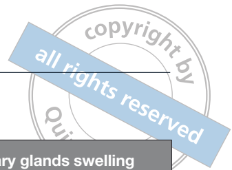
Table 2 Detection rate of IOI in the PET and the non-PET groups.