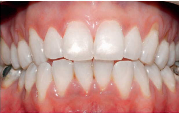
Fig 3 Buccal view of worn root on maxillary right first, second premolars and left canine, first and second premolars (patient 2).