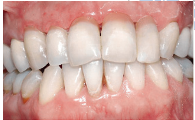
Fig 2 Buccal view of the restorations at baseline (patient 1).