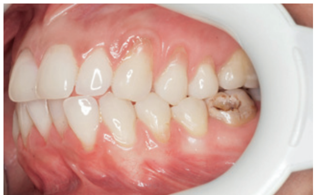
Fig 9 Left side view of the restorations at 3-year recall (patient 2).