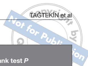
Table 2 Distribution frequency of the scores for the evaluated USPHS criteria of restorations