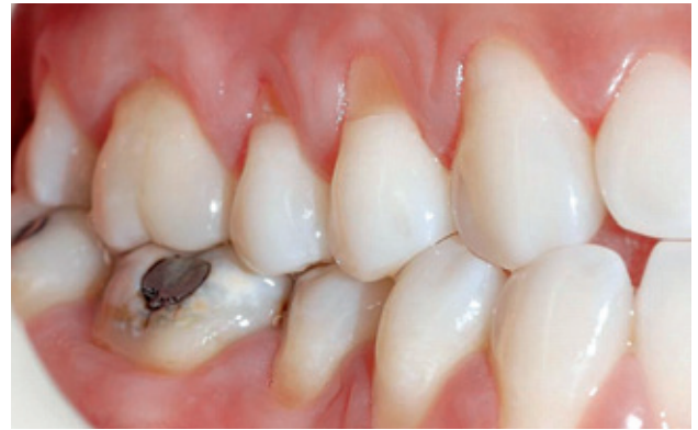
Fig 4 Right side view of gingival recession and worn root (patient 2).

composite (Grandio, Voco, Germany). Figure 2 shows the buccal view of the restorations of Patient 1 at baseline. Periodontally operated interdental papillas were missing on the baselines.