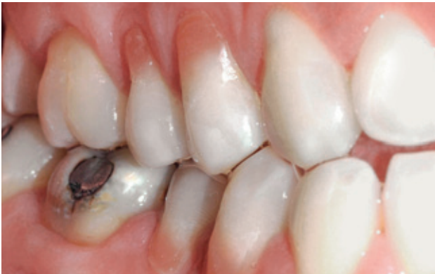
Fig 7 Right side view of the restorations at 2-year recall (patient 2).