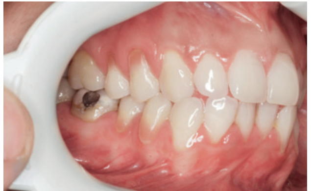
Fig 8 Right side view of the restorations at 3-year recall (patient 2).