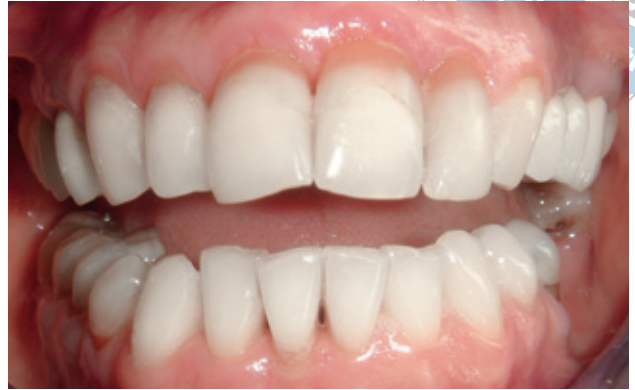
Fig 6 Extraoral general view of restorations with marginal discoloration at 3-year recall (patient 1).