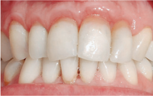
Fig 5 Buccal view of the restorations at 2-year recall (patient 1).