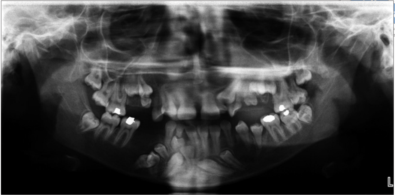
Fig 1 Panoramic radiograph showing the presence of impacted teeth, some of which are supernumerary teeth.

one partially erupted tooth in the region of lateral and canine teeth. The panoramic radiograph showed the presence of 16 impacted teeth in all four quadrants (Fig 1). In the maxilla, they were located bilaterally in the premolar regions. In the middle part of the mandible, eight impacted teeth were located as a group.