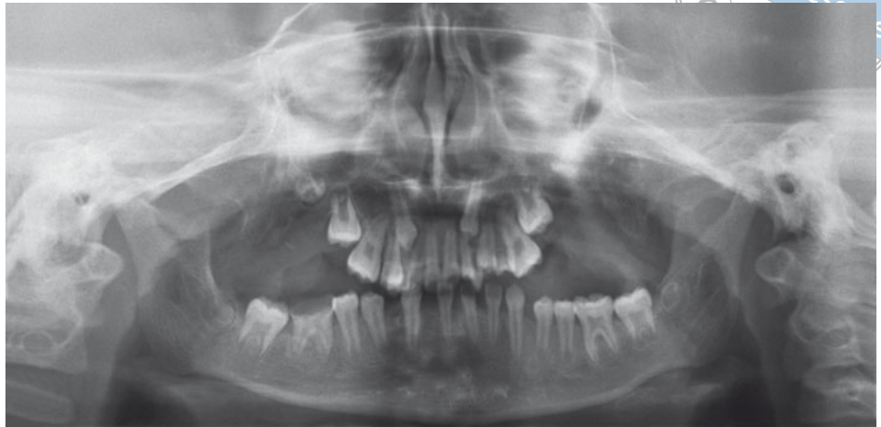
Fig 6 Panoramic radiograph after the surgery. The supernumerary teeth and part of the bone in the two accessory maxillae were removed.

Swallowing of amniotic bands may also produce bizarre orofacial clefts, distortions and disruptions of craniofacial structures 18 . The craniofacial lesions are frequently asymmetrical and do not conform to the anatomy of the normal facial clefts. They can include cleft lip, cleft palate, microphthalmia, and abnormal skull calcification, as well as asymmetric anencephaly, encephalocele, and decapitation 19 .