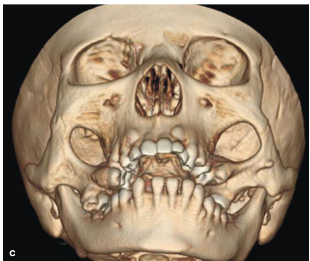
Fig 5 3D image of the patient. Note the dysplastic bony prominences extending from the inside of the zygomatic arch to the maxillary tuberosity.