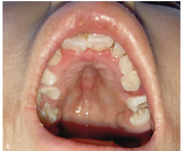
Fig 2 Oral view of the patient. (a) The right part of dental arch. (b) The left part of dental arch. (c) High-arched palate.